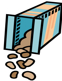
Box of Biscuits 75p

Complete the tear-off slip below and return it to: