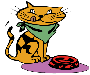
Cat Food 50p